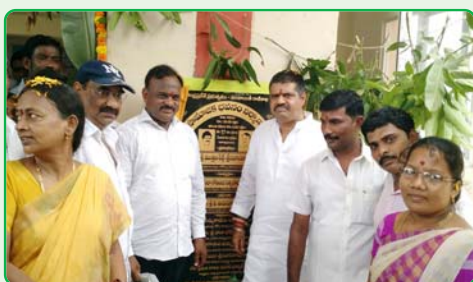
Inauguration of Community hall