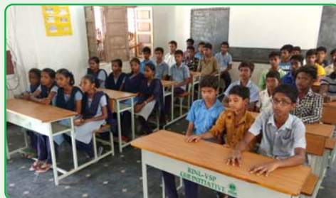
Pathashala Ki Aabharanam