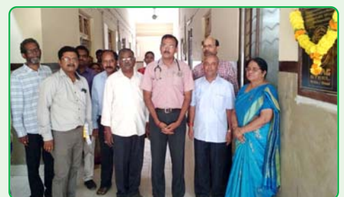
Inauguration of Toilets at RMC Kakinada